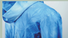
Shibori (Tye dyeing)