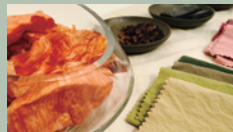
Onibegie (Dyeing using natural ingredients)