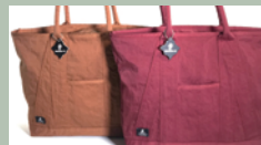
Konbu (High coloring and high hardness)