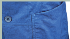
Digo Vintage (Indigo dyeing)