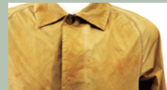
Surf Vintage (Uneven dyeing)