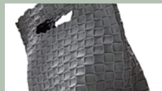
WG Konbu (WG + high coloring and high hardness)