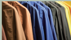
Regular (Including polyester, nylon and natural fibers)

It's possible to produce various expressions at the same time as dyeing. Unique textures which can only be obtained with garment dyeing can also be produced