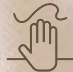
A feeling of bulge